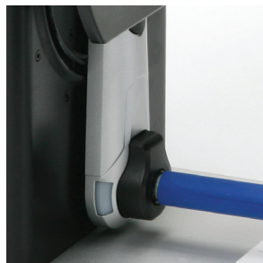
Colored LED indicator provides rewinder operation status