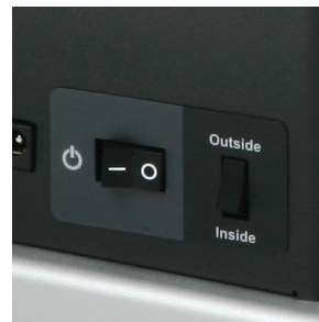
Rewinding direction switch to rewind "inside or outside" label rolls